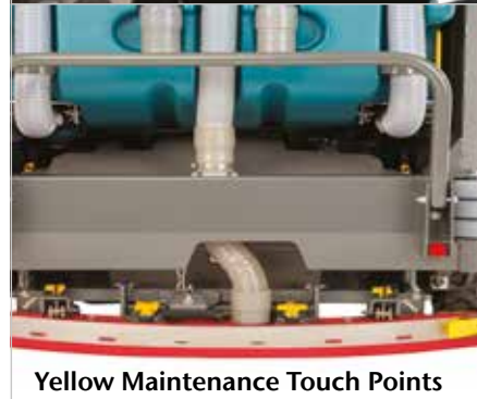
Yellow Maintenance Touch Points

Overhead guard protects operators from falling objects.