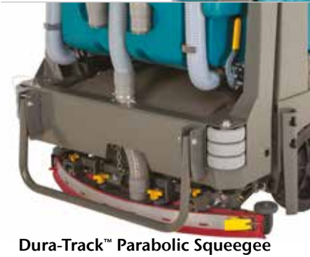
Dura-Track™ Parabolic Squeegee