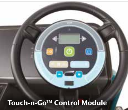
Touch-n-Go™ Control Module