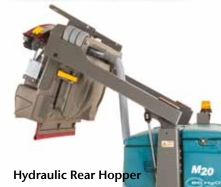
Hydraulic Rear Hopper