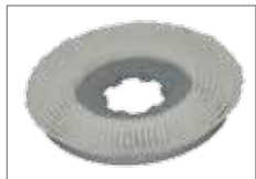
535.059 Scrubbing brush