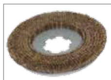
535.0595K 5K brush (supermarket mix)