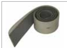
535.082 Rubber blade standard