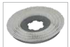
535.073 Exposed aggregate pavement brush