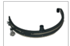
535.560 Suction nozzle curved