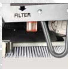
Filter and safety bar