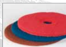
535.910.5 Pad red (5 pcs.) 535.911.5 Pad blue (5 pcs.) 535.912.5 Pad brown (5 pcs.)