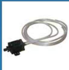
Chemical dosing CADS