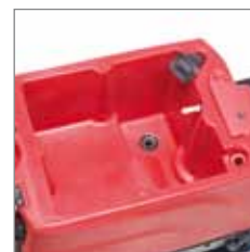
Dirty water tank easy to clean