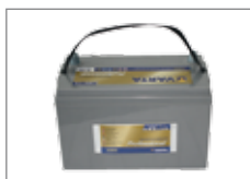
436.093 AGM batteries