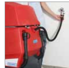
Filling up hose for fresh water (optional)