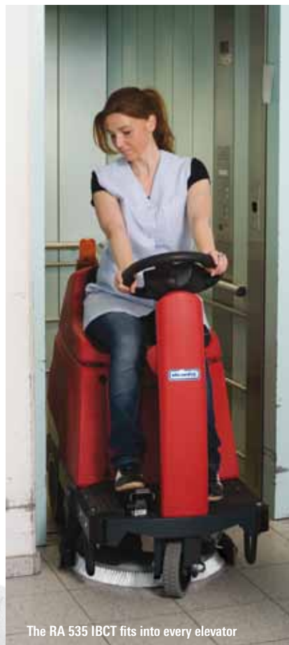
The RA 535 IBCT fits into every elevator