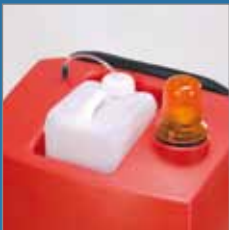
Chemicals canister for dosing