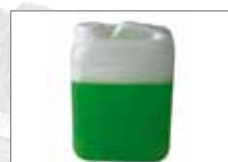
565.535 Canister 5 litres empty