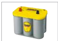
436.091 Spiral Cell batteries