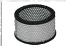
535.450 Hepa filter cartridge