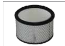
535.440 Filter cartridge standard