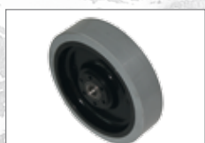
535.240 Traction wheel „supergrip“