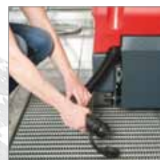
Waste water discharge