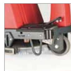
Suction base mounted directly behind the brush

Tight curve radius, narrow doors, narrow passages – a piece of cake for the ride-on scrubber-dryer which starts at the push of a button.