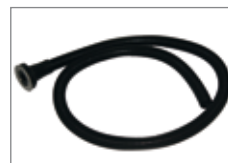
535.110 Filling up hose for fresh water