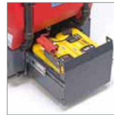
Extendable battery box charging plug