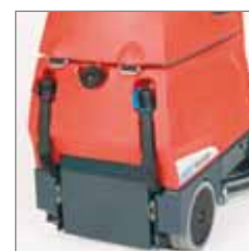
Rear view with fresh- and waste water tank discharge