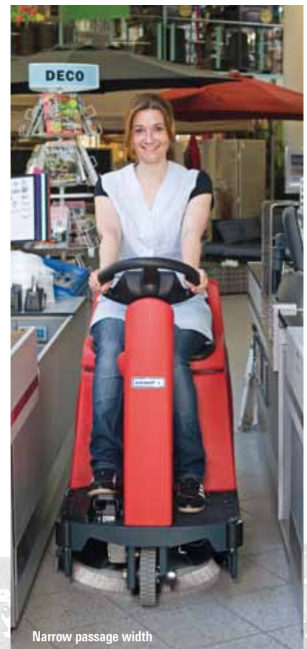
Narrow passage width