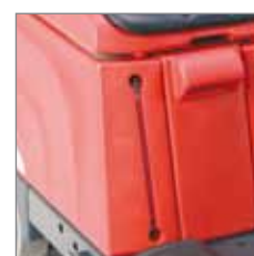
Fresh water level display