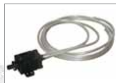
535.100 Compl. Chemical dosing