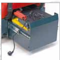
Charging connector to charge the batteries