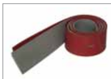
535.083 Rubber blade linatex (tile floors)