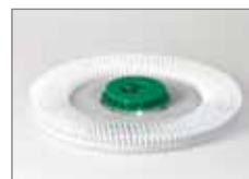
535.070 Driving disc