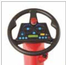
Operating panel with charge indicator