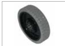
535.230 Traction wheel standard