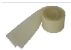
535.081 Rubber blade oil resistant