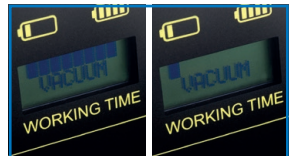
Adjustable suction power