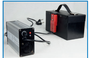
Multi-tension, ventilated battery charger