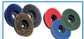
Brushes and pads