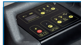
Instrument panel with intuitive buttons